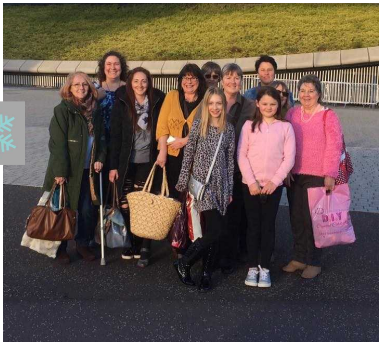
Barrhill Craft Group visit the SEC Glasgow

We're here to help you on your road to success, so do get in touch.