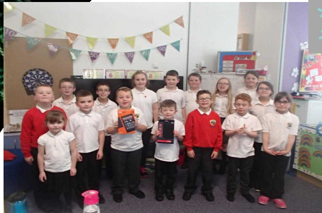
Pupils delighted to receive gift of a Kindle Fire tablet